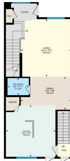
Main Floor Exterior Area 856.20 sq ft