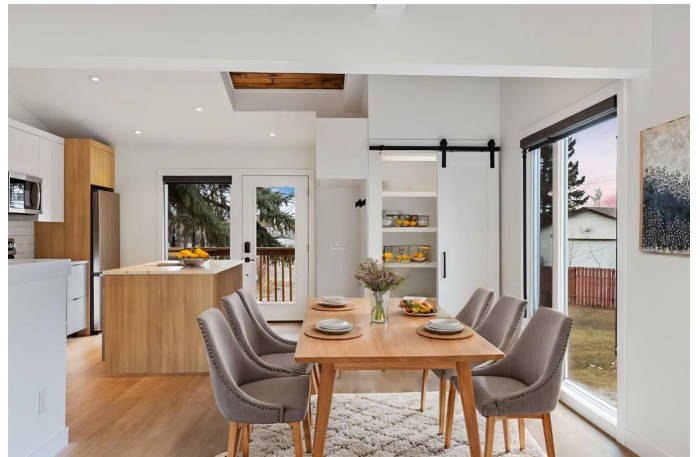
19A Arlington Pl SE, Calgary, AB