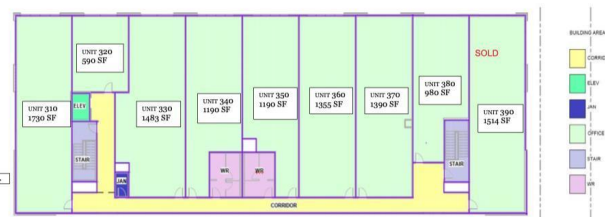
3 AREA PLAN - 3RD FLOOR A03 1:200