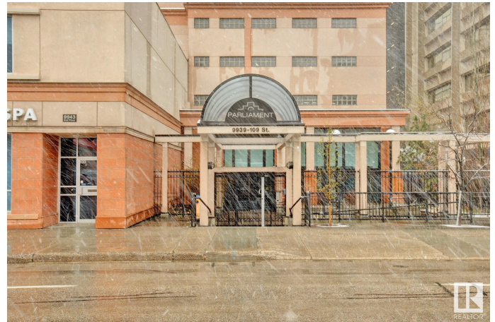
805-9939 109 St NW, Edmonton, AB