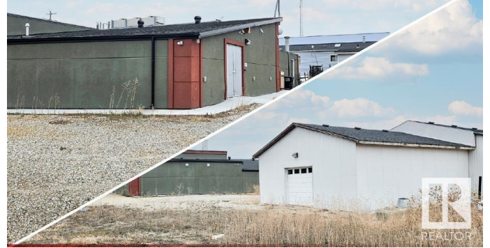
MAIN BUILDING PLAN